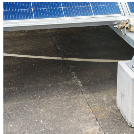
ABB central inverters PVS800 - 500 to 1000

From Nassau to the Family Islands, we supply premium solar panels, inverters, and batteries to installers across New Providence, Grand Bahama, Abaco, Eleuthera, and beyond.