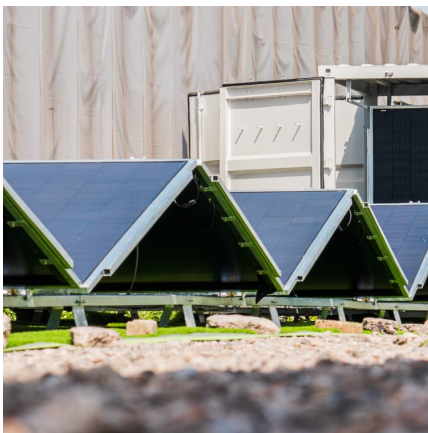
Photo-charging sodium-ion battery by gallium arsenide solar cell

Photo-charging energy storage system integrating photovoltaic harvest and energy storage functions creates a sustainable power source. The system not only alleviates ...