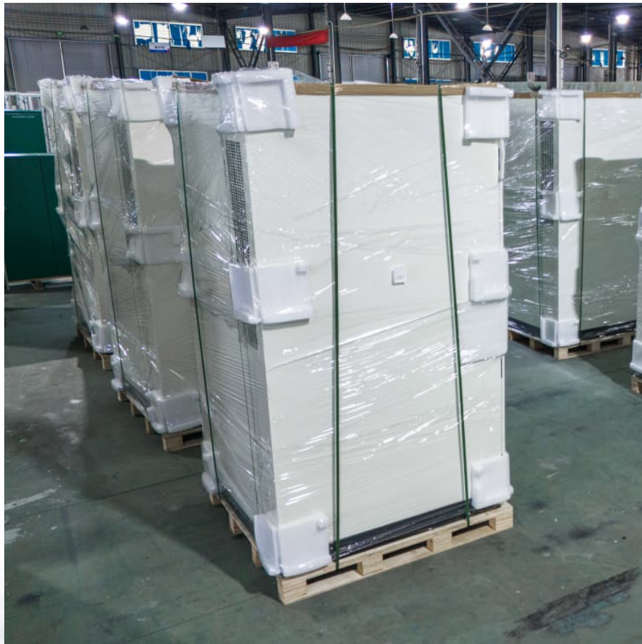
Image of the intelligent control box of the energy storage station