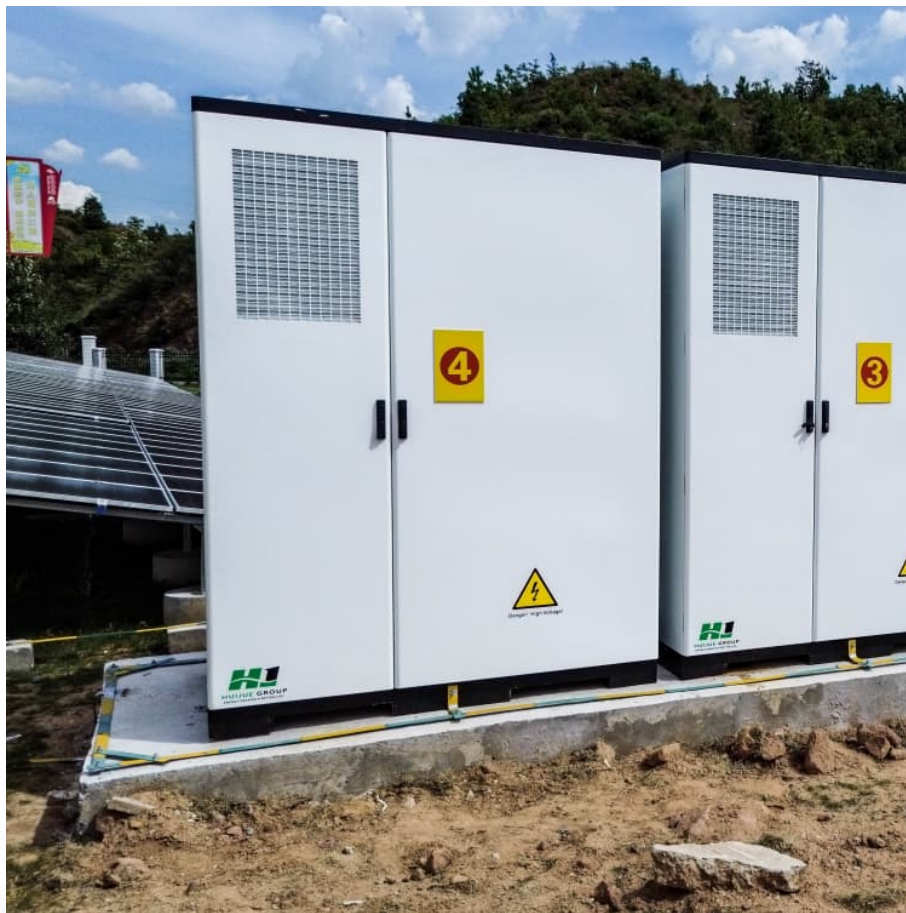
Image of the tram s large energy storage cabinet