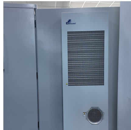
Image of the tram s large energy storage cabinet

Find Energy Storage Cabinet stock images in HD and millions of other royalty-free stock photos, 3D objects, illustrations and vectors in the Shutterstock ...