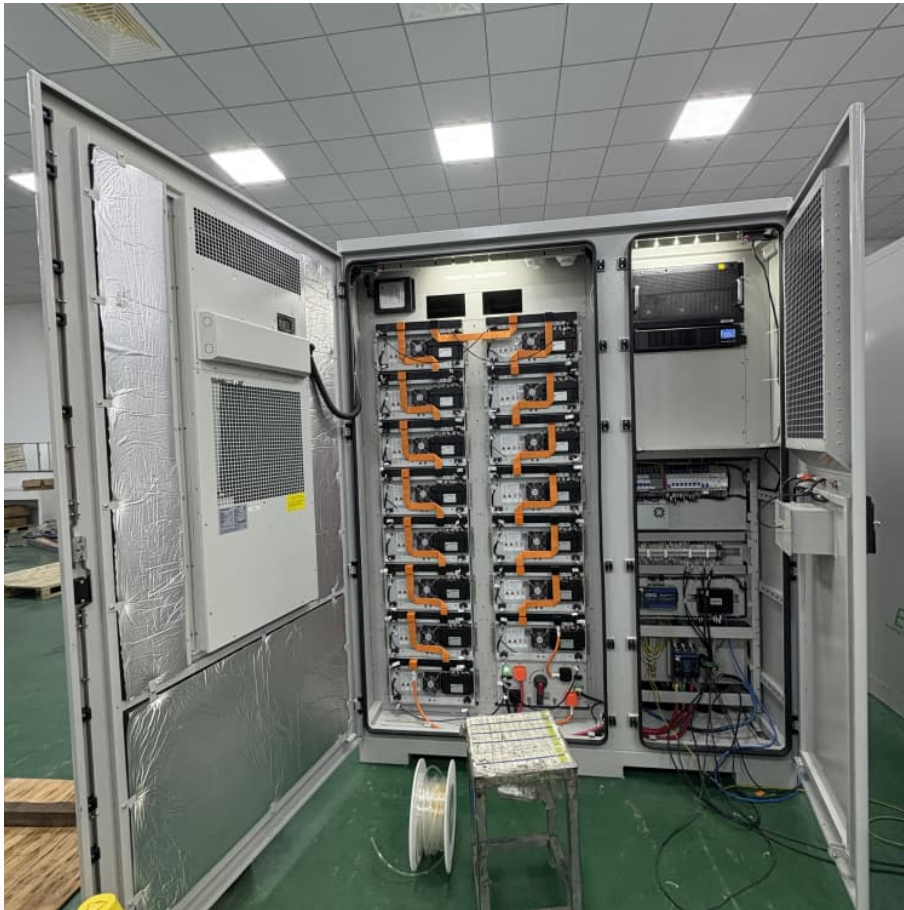
Photo of the energy storage inverter being burned