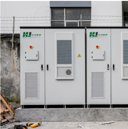
Photo-thermal energy storage power generation system

Description technical field [0001] The invention relates to the technical field of photothermal power generation, in particular to a photothermal energy storage power generation system. ...