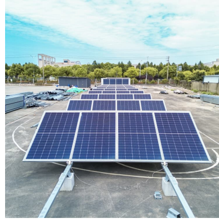
EXHIBIT , Saudi Projects

Aligned with Saudi Vision 2030, the International Exhibition for Construction & Sustainable Building stands as one of the region's premier events, bringing together top local and global companies alongside sustainability pioneers ...